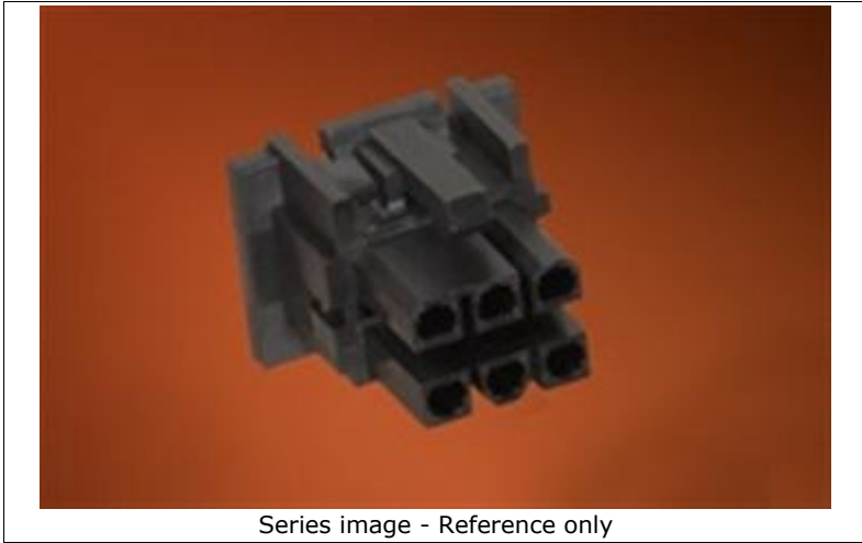
Series image - Reference only