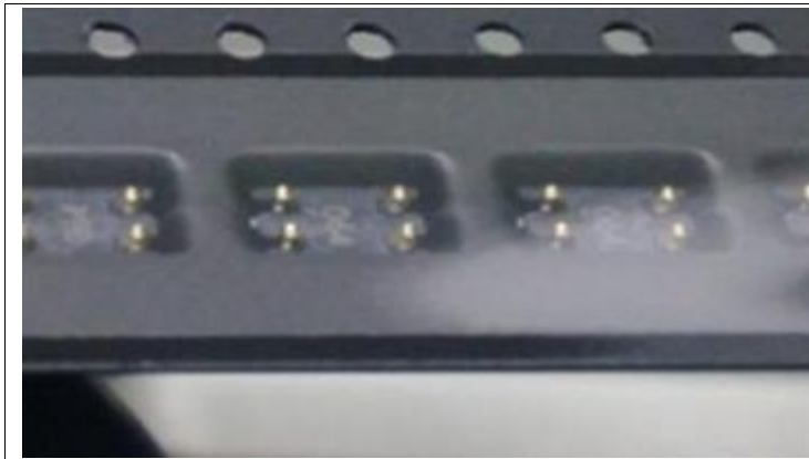
Before: Black Emboss