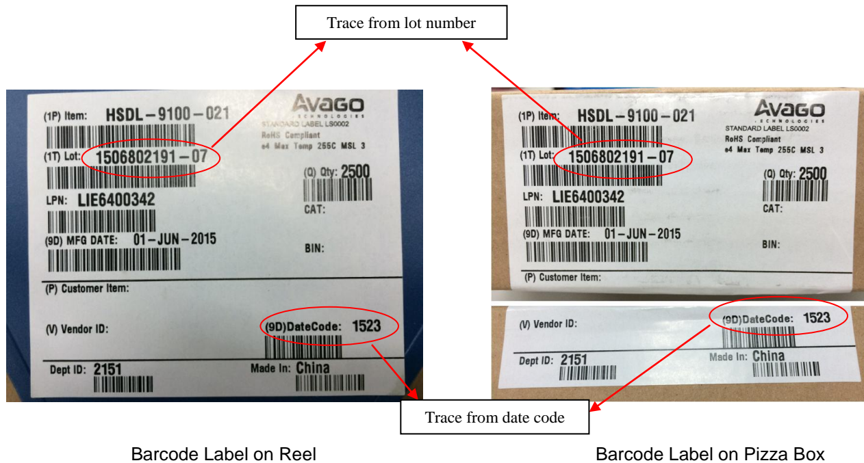
Figure 2: Barcode Label

These changes have been reviewed and approved by Avago Technologies engineers and managers per Avago Technologies procedure: Change Control and Customer Notification, A-5962-6052-80.