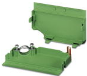
Cable housing, Pitch: 0 mm, Number of positions: 16, Dimension a: 80 mm, Color: green

Please be informed that the data shown in this PDF Document is generated from our Online Catalog. Please find the complete data in the user's documentation. Our General Terms of Use for Downloads are valid ( http://phoenixcontact.com/download )