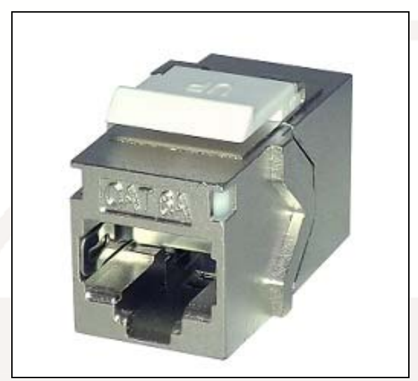
Category 6A Shielded Keystone Panel Mount Coupler (SGACK2S, SGACK2S-24)