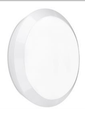
25W Polycarbonate IP66 Round LED Bulkhead