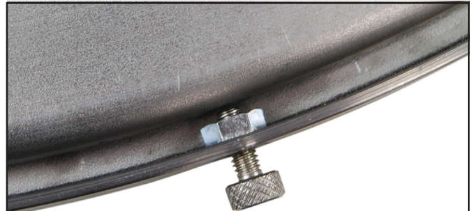
Figure 2. Thumbscrew Locks

*The Gyro-Stat ® Bench Top Turntable may also be used on a floor or other surface. In order to be grounded it must be on a surface that provides a path to ground.