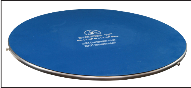
Figure 1. Vermason 237191 Gyro-Stat ® ESD Bench Top Turntable