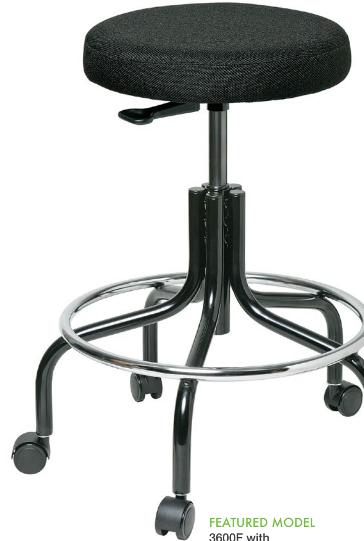
FEATURED MODEL 3600F with CADS/5 casters