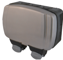
WPL22 RCD (Angled)