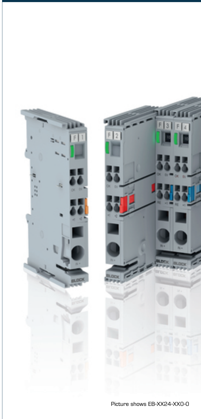
Picture shows EB-XX24-XX0-0