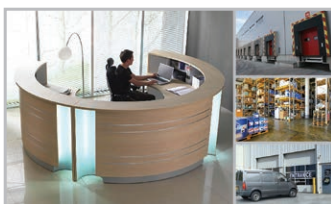
Main Monitor & Split Screen