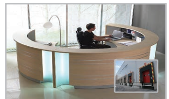
Picture in Picture