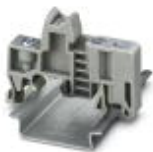
End clamp, Width: 9.5 mm, Height: 35.3 mm, Length: 50.5 mm, Color: gray