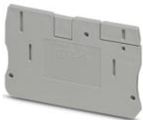
End cover, Length: 57.7 mm, Width: 2.2 mm, Height: 42 mm, Color: gray

Please be informed that the data shown in this PDF Document is generated from our Online Catalog. Please find the complete data in the user's documentation. Our General Terms of Use for Downloads are valid ( http://phoenixcontact.com/download )