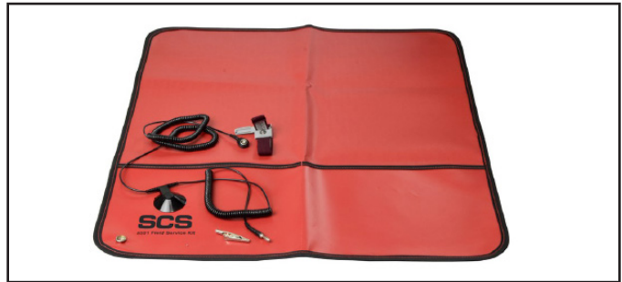
Figure 2. 8501 Field Service Kit.