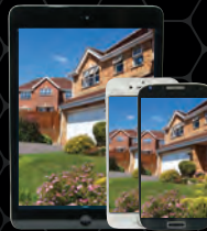
Easy setup for remote access

The NightWatcher NW760 detects motion within the 220° field of vision of the PIR and turns the lamp and camera to point directly at and then follow the intruder. When motion is detected, the super-bright 16W LED will light up at night and the built-in HD camera records video to the SD card 24/7. You can also view and record live video on your smartphone via the free app and while you are away, receive push alarm alerts when motion is detected and review recorded footage.*