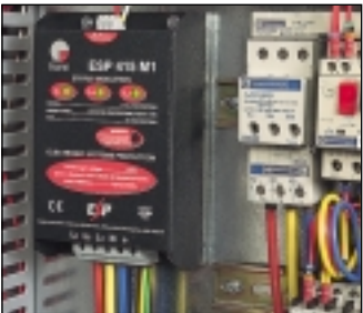
ESP 415 M1 installed within a control panel on the mains input to protect the panel's control systems. Note the remote indication connection (top of protector).

On applications requiring an extra high maximum surge current, use the ESP 415 M2 or ESP 415 M4. For supplies fused at 16 amps or less, use the ESP ***/5A or /16A boxed or unboxed protectors. Where the display panel needs to be mounted separately from the main protector, use the ESP 415 M1R.