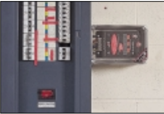
An ESP 415 M1 mounted, within a WBX 4 enclosure, directly alongside a mains panel and connected to its first outgoing way. Note how the protector is mounted on its side to help keep its connecting leads as short as possible.

Use on mains power distribution systems to protect connected electronic equipment from transient overvoltages on the mains supply, eg computer, communications or control equipment.