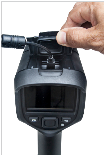
Download images fast via USB

Specifications are subject to change without notice. For the most up-to-date specifications, go to www.flir.com