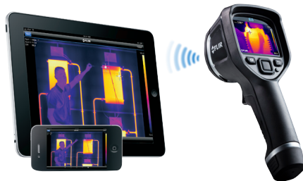
Wireless Connectivity to Smartphones, Tablets and more.

PORTLAND Corporate Headquarters FLIR Systems, Inc. 27700 SW Parkway Ave. Wilsonville, OR 97070 PH: +1 866.477.3687