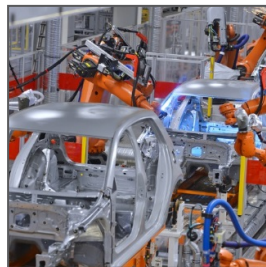
Industrial Automation: Equipment