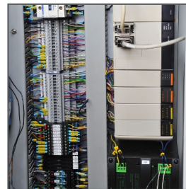
Industrial Automation: Networks