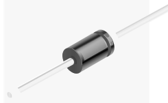
DO-35 Glass case COLOR BAND DENOTES CATHODE