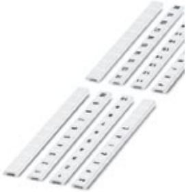
Zack marker strip flat, 10-section, horizontally labeled with the consecutive numbers: 21 ... 30, white

Please be informed that the data shown in this PDF Document is generated from our Online Catalog. Please find the complete data in the user's documentation. Our General Terms of Use for Downloads are valid ( http://phoenixcontact.com/download )