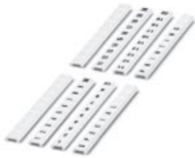
Zack marker strip flat, 10-section, horizontally labeled with the consecutive numbers: 31 ... 40, white

Please be informed that the data shown in this PDF Document is generated from our Online Catalog. Please find the complete data in the user's documentation. Our General Terms of Use for Downloads are valid ( http://phoenixcontact.com/download )