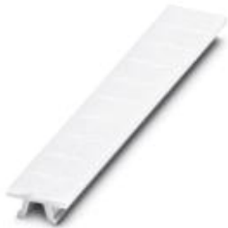
Zack marker strip, 10-section, horizontally labeled with the consecutive numbers: 31 ... 40, white, Width: 6 mm

Please be informed that the data shown in this PDF Document is generated from our Online Catalog. Please find the complete data in the user's documentation. Our General Terms of Use for Downloads are valid ( http://phoenixcontact.com/download )