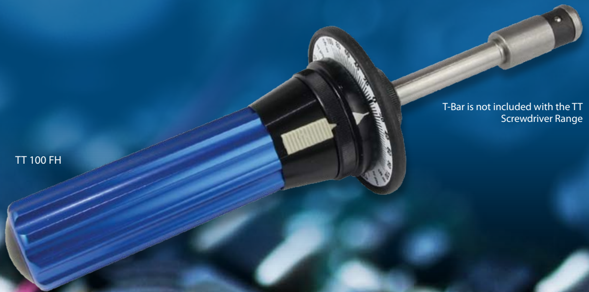
TT 100 FH

cost and versatile tools provide accuracy, reliability and economy in a wide range of Maintenance and Repair, Quality Control, R & D and Assembly operations in any engineering or manufacturing environment.