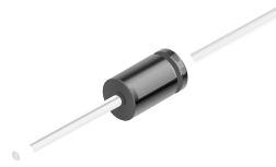
DO-35 Color Band Denotes Cathode