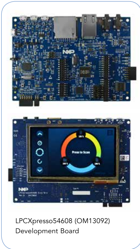
LPCXpresso54608 (OM13092) Development Board

The LPC546xx MCU family is architected to be power efficient for applications that require data aggregation from several different inputs. This MCU family provides a variety of wake-up sources including the FlexComm peripherals. Once the MCU becomes active, application use cases are endless with 10 FlexComm interfaces for sensors and HMI, options for cloud connectivity, and a graphics display to interact with the information.