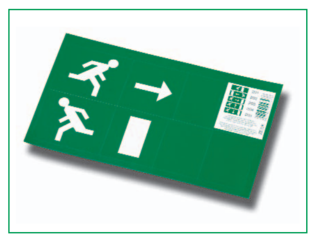
Zeta II legend kit