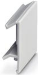
Filler plug for unoccupied terminal points, color: Light gray

Please be informed that the data shown in this PDF Document is generated from our Online Catalog. Please find the complete data in the user's documentation. Our General Terms of Use for Downloads are valid ( http://phoenixcontact.com/download )