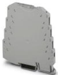
Complete housing without vents, Color: light gray, Width: 6.2 mm, Constructional height: 101.2 mm

Please be informed that the data shown in this PDF Document is generated from our Online Catalog. Please find the complete data in the user's documentation. Our General Terms of Use for Downloads are valid ( http://phoenixcontact.com/download )