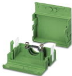
Cable housing, Pitch: 0 mm, Number of positions: 5, Dimension a: 25 mm, Color: green

Please be informed that the data shown in this PDF Document is generated from our Online Catalog. Please find the complete data in the user's documentation. Our General Terms of Use for Downloads are valid ( http://phoenixcontact.com/download )