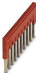
Plug-in bridge, Pitch: 5.2 mm, Length: 22.7 mm, Width: 50.6 mm, Number of positions: 10, Color: red

Please be informed that the data shown in this PDF Document is generated from our Online Catalog. Please find the complete data in the user's documentation. Our General Terms of Use for Downloads are valid ( http://phoenixcontact.com/download )