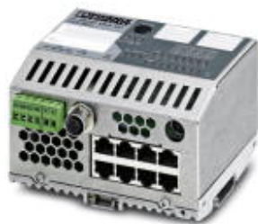
Ethernet Smart Managed Compact Switch with eight 10/100/1000 Mbps RJ45 ports

Please be informed that the data shown in this PDF Document is generated from our Online Catalog. Please find the complete data in the user's documentation. Our General Terms of Use for Downloads are valid ( http://phoenixcontact.com/download )