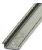
DIN rail, material: Steel, unperforated, height 7.5 mm, width 35 mm, length: 2 m

DIN rail, unperforated - NS 35/ 7,5 UNPERF 2000MM - 0801681