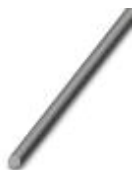
Connection pin, Length: 1000 mm, Color: gray