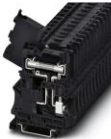
Lever-type fuse terminal block, black, for 6.3 x 32 mm G fuse inserts

Please be informed that the data shown in this PDF Document is generated from our Online Catalog. Please find the complete data in the user's documentation. Our General Terms of Use for Downloads are valid ( http://phoenixcontact.com/download )