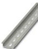
DIN rail, material: steel galvanized and passivated with a thick layer, perforated, height 7.5 mm, width 35 mm, length: 2000 mm

DIN rail perforated - NS 35/ 7,5 PERF 2000MM - 0801733