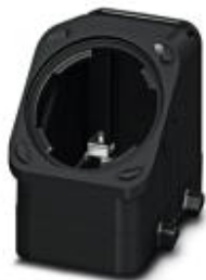
HEAVYCON EVO sleeve housing, plastic, with bayonet flange for EVO screw connection, B10, for double locking latch, height: 60.5 mm, without EVO screw connection

Please be informed that the data shown in this PDF Document is generated from our Online Catalog. Please find the complete data in the user's documentation. Our General Terms of Use for Downloads are valid ( http://phoenixcontact.com/download )