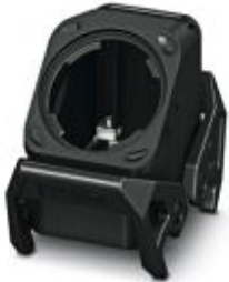
HEAVYCON EVO sleeve housing, plastic, with bayonet flange for EVO screw connection, B10, with double locking latch, height: 60.5 mm, without EVO screw connection

Please be informed that the data shown in this PDF Document is generated from our Online Catalog. Please find the complete data in the user's documentation. Our General Terms of Use for Downloads are valid ( http://phoenixcontact.com/download )