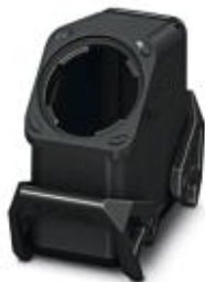
HEAVYCON EVO coupling housing, plastic, with bayonet flange for EVO screw connection, B16, with double locking latch, height: 84 mm, without EVO screw connection

Please be informed that the data shown in this PDF Document is generated from our Online Catalog. Please find the complete data in the user's documentation. Our General Terms of Use for Downloads are valid ( http://phoenixcontact.com/download )