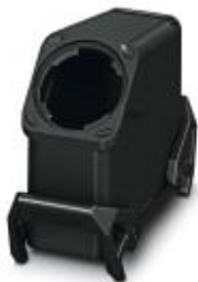
HEAVYCON EVO sleeve housing, plastic, with bayonet flange for EVO screw connection, B24, with double locking latch, height: 87.5 mm, without EVO screw connection

Please be informed that the data shown in this PDF Document is generated from our Online Catalog. Please find the complete data in the user's documentation. Our General Terms of Use for Downloads are valid ( http://phoenixcontact.com/download )