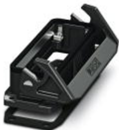
HEAVYCON EVO panel mounting base, plastic, B24, with single locking latch, height: 30.5 mm, with flat gasket

Please be informed that the data shown in this PDF Document is generated from our Online Catalog. Please find the complete data in the user's documentation. Our General Terms of Use for Downloads are valid ( http://phoenixcontact.com/download )