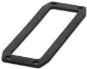
Replacement flat gasket, for HEAVYCON EVO panel mounting base type B16

Please be informed that the data shown in this PDF Document is generated from our Online Catalog. Please find the complete data in the user's documentation. Our General Terms of Use for Downloads are valid ( http://phoenixcontact.com/download )