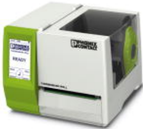
Thermal transfer printer for material off the roll

Please be informed that the data shown in this PDF Document is generated from our Online Catalog. Please find the complete data in the user's documentation. Our General Terms of Use for Downloads are valid ( http://phoenixcontact.com/download )