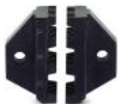
Spare die for CRIMPFOX 25R

Replacement die - CRIMPFOX 25R/DIE - 1212040