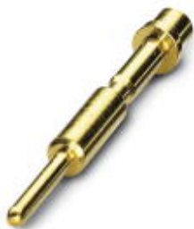
Crimp contact, turned, Single contact, Contact diameter: 1 mm, Crimp range: 0.06 mm 2 ...0.25 mm 2

Please be informed that the data shown in this PDF Document is generated from our Online Catalog. Please find the complete data in the user's documentation. Our General Terms of Use for Downloads are valid ( http://phoenixcontact.com/download )