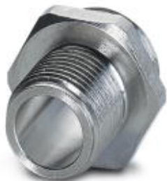
Housing screw connection, PlugLink:M12, Front mounting, M14 x 1

Please be informed that the data shown in this PDF Document is generated from our Online Catalog. Please find the complete data in the user's documentation. Our General Terms of Use for Downloads are valid ( http://phoenixcontact.com/download )