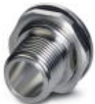
Sample set, PlugLink:M12, Rear mounting, M15 x 1

Sample set - SACC-BP-M-M12/M15-6-THR SP - 1421842