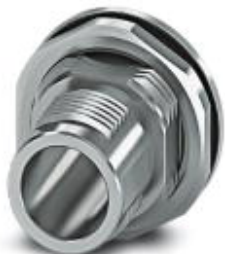
Housing screw connection, PlugLink:M12-SPEEDCON, Rear mounting, M15 x 1

Please be informed that the data shown in this PDF Document is generated from our Online Catalog. Please find the complete data in the user's documentation. Our General Terms of Use for Downloads are valid ( http://phoenixcontact.com/download )