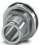
Sample set, PlugLink:M12-SPEEDCON, Rear mounting, M15 x 1

Sample set - SACC-BP-M-M12/M15-6-THR SCO SP - 1421844