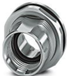
Housing screw connection, SocketLink:M12-SPEEDCON, Rear mounting, M15 x 1

Please be informed that the data shown in this PDF Document is generated from our Online Catalog. Please find the complete data in the user's documentation. Our General Terms of Use for Downloads are valid ( http://phoenixcontact.com/download )