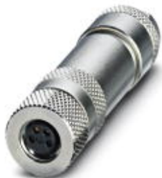
Connector, 4-position, shielded, Socket straight M8, A-coded, Screw connection, Knurl material: Nickel-plated brass, External cable diameter 3.5 mm ... 5.5 mm

Please be informed that the data shown in this PDF Document is generated from our Online Catalog. Please find the complete data in the user's documentation. Our General Terms of Use for Downloads are valid ( http://phoenixcontact.com/download )