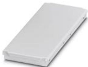
Installation component housing, Housing cover, Color: light gray, Width: 107.6 mm

Please be informed that the data shown in this PDF Document is generated from our Online Catalog. Please find the complete data in the user's documentation. Our General Terms of Use for Downloads are valid ( http://phoenixcontact.com/download )