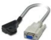
Data cable for communication between devices with a D-SUB 9 RS-232 connection and Phoenix Contact devices with the 12-pos. IFS data port such as QUINT UPS-IQ or TRIO UPS.

Data cable - IFS-RS232-DATACABLE - 2320490