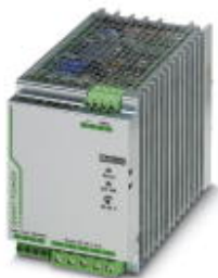
Primary-switched QUINT POWER power supply for DIN rail mounting with SFB (Selective Fuse Breaking) Technology, input: 3-phase, output: 48 V DC/20 A

Please be informed that the data shown in this PDF Document is generated from our Online Catalog. Please find the complete data in the user's documentation. Our General Terms of Use for Downloads are valid ( http://phoenixcontact.com/download )