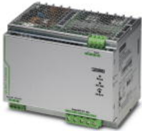
Primary-switched QUINT POWER power supply for DIN rail mounting with SFB (Selective Fuse Breaking) Technology, input: 1-phase, output: 48 V DC/20 A

Please be informed that the data shown in this PDF Document is generated from our Online Catalog. Please find the complete data in the user's documentation. Our General Terms of Use for Downloads are valid ( http://phoenixcontact.com/download )